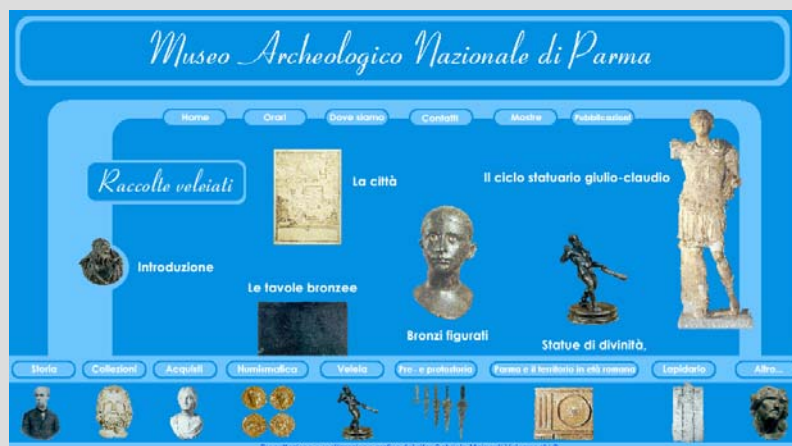
Fig. 2 – Veleia's Collections Page