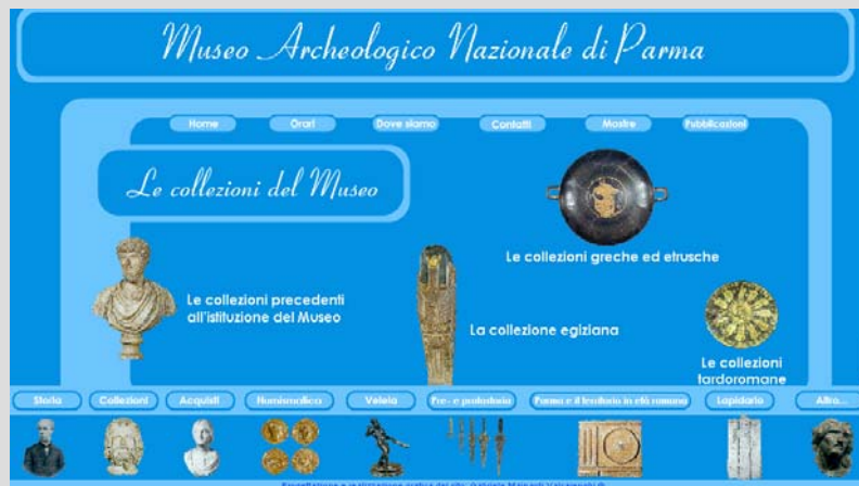
Fig. 1 – Collections Page