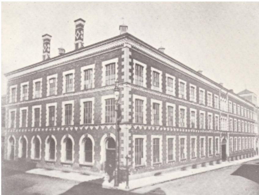
Typical Londonderry Shirt-Making Factory From the book Ireland industrial and agricultural , Department of Agriculture and Technical Instruction for Ireland, Browne and Nolan Ltd., 1902