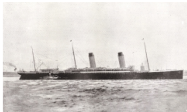
White Star Line "Oceanic" From the book Ireland industrial and agricultural , Department of Agriculture and Technical Instruction for Ireland, Browne and Nolan Ltd, 1902

The National Archives will continue to develop its Website http://www.nationalarchives.ie as the first point of contact for those seeking to access their archival heritage. Informational content will continue to be augmented and remain the core of the service. However, a new focus will be applied to the development of the site as a vehicle for interactive, experiential and transactional services to the public.