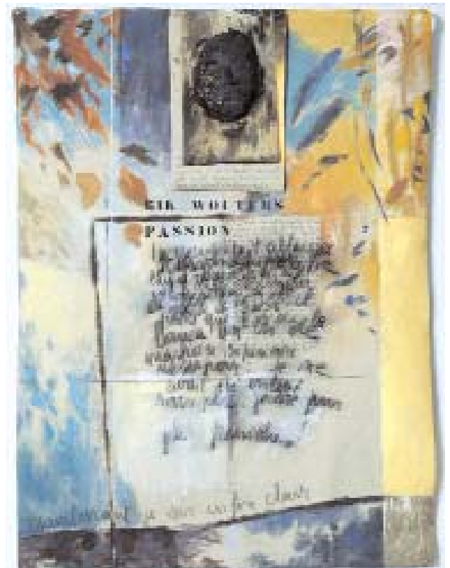
Jacques Lennep, Rik Wouters passion , 1995

Multiannual Information Society Support Programme (2001-2008) . The Programme is implemented by the Federal Science Policy department and backs up the various initiatives taken elsewhere. Its aim is to stimulate the use of information technologies in target sectors through application projects. The technologies concern the complete array of tools for, e.g., digitizing, processing, exchanging and disseminating information of all kinds, emphasizing what is actually at stake with respect to the interoperability of existing systems. The programme has a multiannual budget (2001-2008) of EUR 15.2 million. For the FSEs, the programme gives the preference to projects that use a cooperative approach to tackle the digitisation of these highly specialised establishments' collections and information holdings with the purpose of ensuring their conservation and facilitating their use.