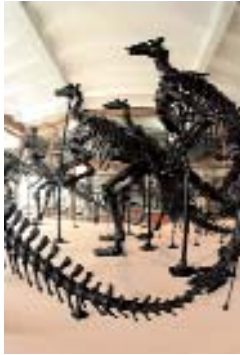
Museum of Natural Sciences, Brussels, interior view

rather limited, yielding an obvious advantage in obtaining a uniformity of practices and systems.