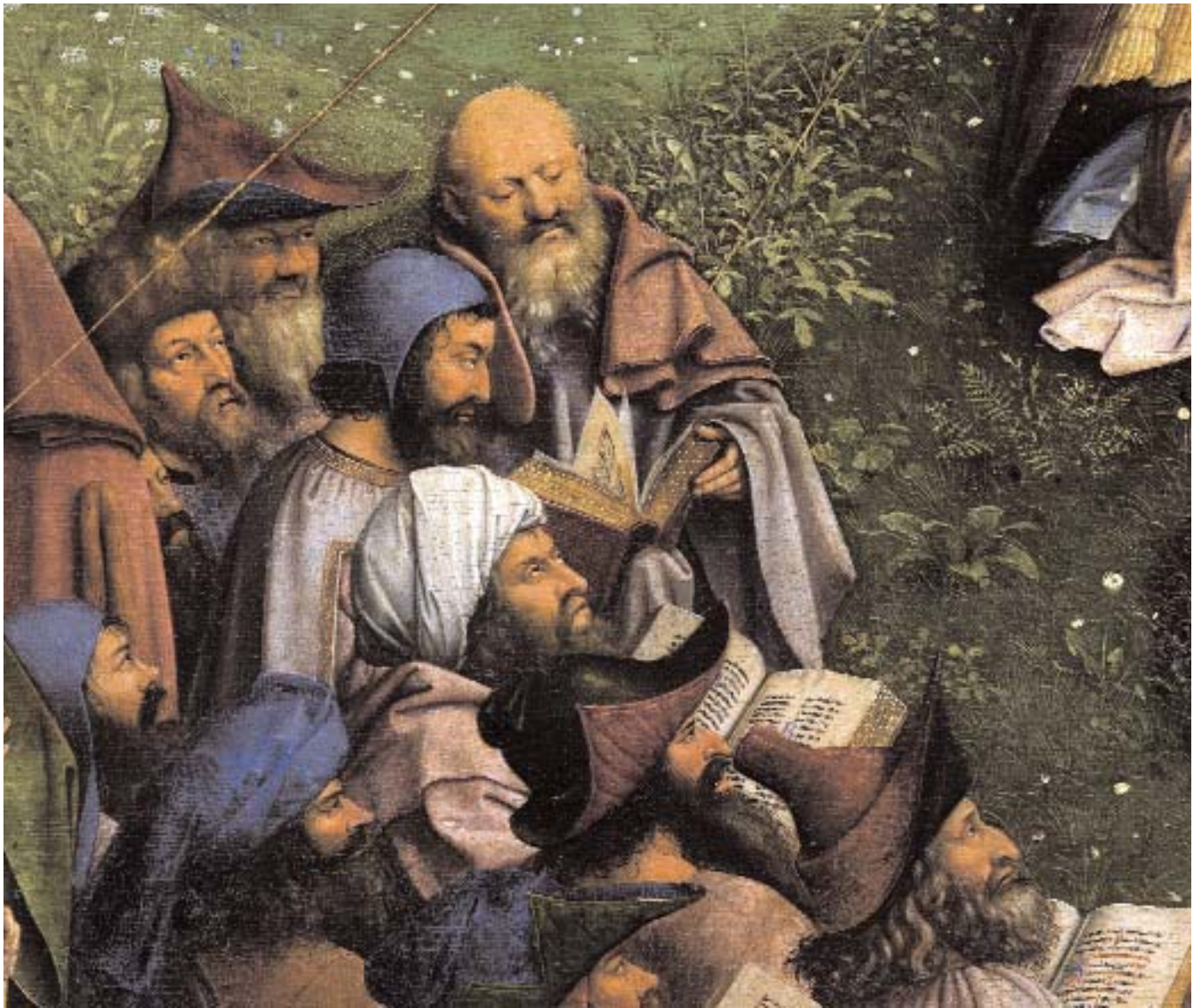
Hubert en Jan Van Eyck, De Aanbidding van het Lam Gods (detail), 1432 St. Bavo's Cathedral of Ghent