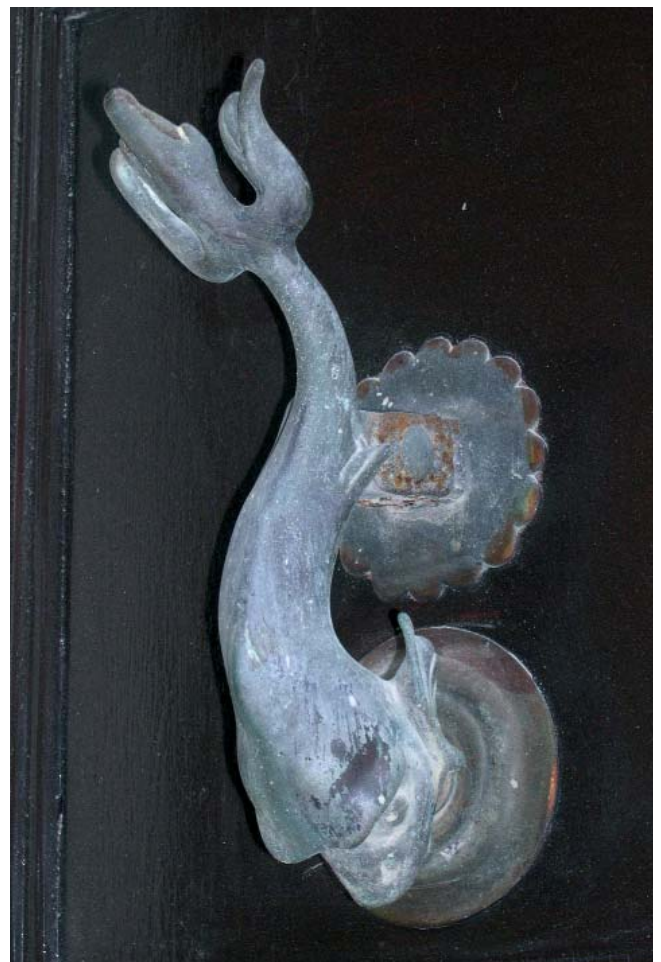
Rabat, door handle