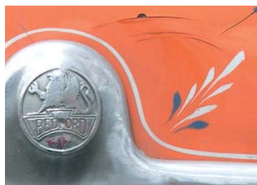
Valletta, old buses, details