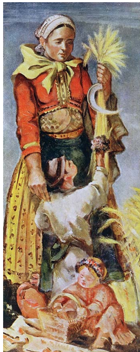
Martin Benka, Strážcovia a ochránkyne [Guards and Guardians], 1942 Book illustration

This is a portal to all Slovak movies (live action, documentary, cartoons) filmed from 1921. It also contains a list of film creators, actors, directors, script writers and film characters. It offers advanced search options. At the moment there are 2135 creators, 393 films, 2685 characters and 344 photographs.