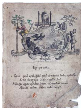
Illustrated baroque epigraph VI, 1600-1700 Illustration with handwritten text

of the World and Multinational digital library and archiving system in technical sciences. Slovak cultural entities have an opportunity of cooperation within the Visegrad group, Culture 2000, MEDIA Plus and EURIMAGES initiatives. After accession to EU, Slovak cultural institutions are largely invited to get involved in R&D Framework Programs. An example is the TEL-ME-MORE (The European Library) project with participation of the Slovak National Library. As for NRG and MINERVA results and their usage, the Good Practice Handbook, Charter of Parma , NRG Terms of Reference and other documents related to digitisation of cultural and scientific heritage (UNESCO) have been translated to Slovak and made widely available at www.viks.sk/digitus . A package of 2003 Status Report, Charter of Parma and Good Practice Handbook is distributed together with Slovak printed version of the Handbook under the title Digitisation of Cultural and Scientific Heritage: Recommendations for Slovak Organisations to about 250 cultural institutions.