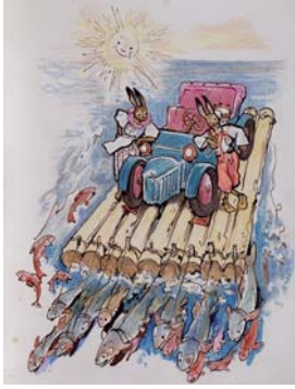
Jaroslav Vodrážka, Ako sa Zajkovci dostali na more [The Bunny Family on the Sea], 1969 Book illustration