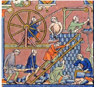
Tower of Babel in the Maciejowski Bible 8

It is worth mentioning the Eurobarometer 7 survey published on the web site that was carried out between May and June 2005 among European citizens including those of the accession countries (Bulgaria and Romania), of candidate countries (Croatia and Turkey) and the Turkish Cypriot Community. One of the most interesting results is that half of the people interviewed say that they can hold a conversation in a second language apart from their mother tongue.